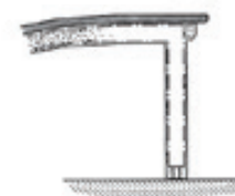
Lower section freestanding