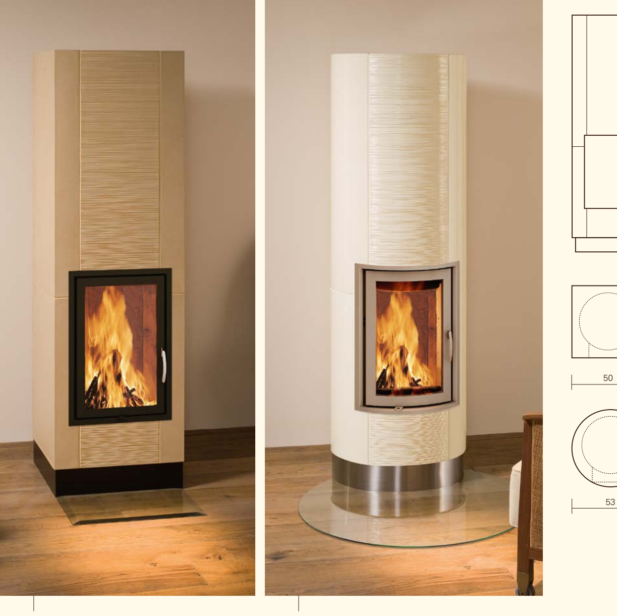
2072_4: square, smooth and flute fine Glaze: 311 sahara Technique: Ofen Innovativ KE 195,7