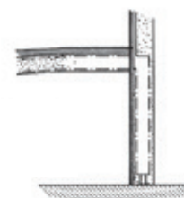
Lower section inserted into wall