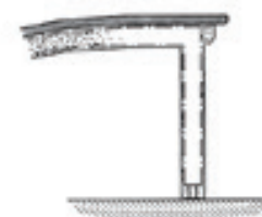
Lower section freestanding